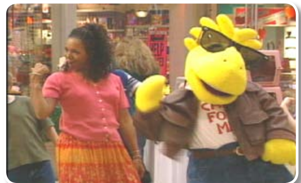
Scenes from the award-winning Tricky People! and Can't Fool Me! DVDs

Research Based: “80% of the students tested demonstrated an increase in knowledge after one cycle of the Yello Dyno Curriculum.”