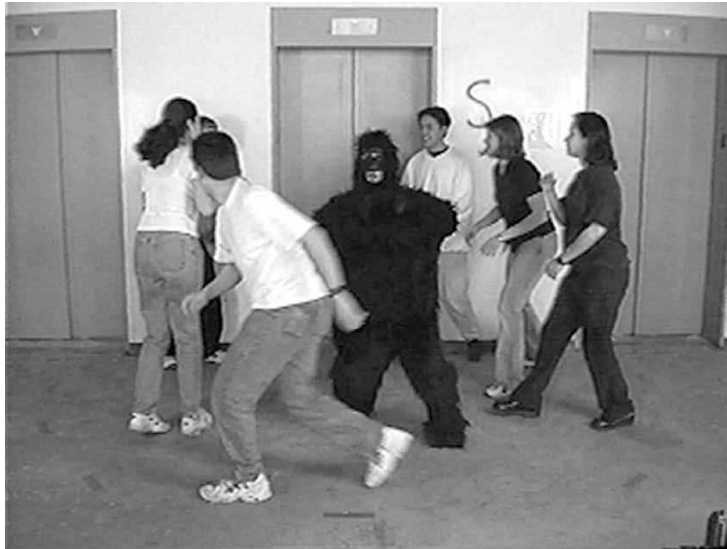
Figure 3. A single frame from an additional experimental condition in which the gorilla stopped in the middle of the display, turned to face the camera, thumped its chest, and then continued walking across the field of view. Subjects performed the Easy monitoring task while attending to the White team, and the noticing rate was similar to that in the corresponding condition with the standard (shorter) Opaque/Gorilla event.

Twelve new observers (6) watched this video while attending to the White team and engaging in the Easy monitoring task; only 50% noticed the event. This is roughly the same as the percentage that noticed the normal Opaque/Gorilla-walking event (42%) under the same task conditions.