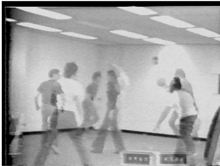
Figure 1. A single frame captured from a late-generation video of the umbrella-woman sequence used by Neisser and colleagues (eg Neisser 1979). The woman is in the center of the image and her umbrella is white.

In subsequent studies of selective looking, Neisser and his colleagues used this 'basketball-game' task [see Neisser (1979) for a description of several different versions]. In the most famous demonstration, observers attend to one team of players, pressing a key whenever one of them makes a pass, while ignoring the actions of the other team. After about 30 s, a woman carrying an open umbrella walks across the screen (this video was also superimposed on the others so all three events were partially transparent; see figure 1). She is visible for approximately 4 s before walking off the far end of the screen. The games then continue for another 25 s before the tape is stopped. Of twenty-eight naive observers, only six reported the presence of the umbrella woman, even when questioned directly after the task (Neisser and Dube, cited in Neisser 1979). Interestingly, when subjects had practice performing the task on two similar trials before the trial with the unexpected umbrella woman, 48% noticed her. When subjects just watched the screen and did not perform any task, they always noticed the umbrella woman, a result consistent with the inattentional-blindness findings reviewed earlier (and with work on saccade-contingent changes; see Grimes 1996; McConkie and Zola 1979).