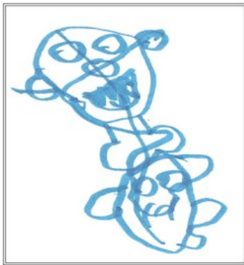
When Dad Yells . This is a drawing by a three-year-old child from a home plagued by domestic violence. This is his depiction of his angry father.

Men commit most violence against men. Men commit most violence committed against women. Women commit most violence against children. Most violence committed by children is against other children. Children commit most violence against pets. The intergenerational 'cycle of violence' is well documented. This intergenerational 'vortex of violence' is not. Violent behavior flows down a power differential. The majority of our violence initiatives and examinations of violence focus on violence of a specific type -- violence committed against voters (typically property owners). Indeed if one man hits another man (especially one with a job), this is a felony - assault and battery, while the same physical violence against a wife or a child is culturally sanctioned, often rationalized as 'deserved' or 'discipline'. Prosecution of the former would proceed; prosecution of the latter would never be pursued. Indeed the victim would often be openly or tacitly ridiculed, and made to feel responsible -- "they deserved it."